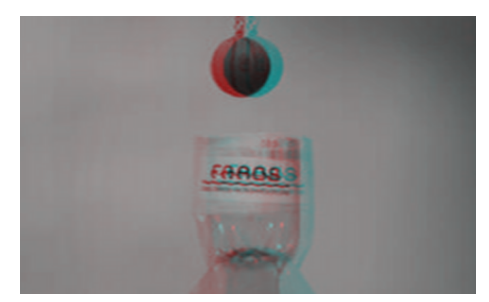
Fig. 1 . Sample video scene captured by the stereoscopic video system. Rendered as a red-cyan anaglyph for printing only.

The software has been developed ad hoc for this particular setup with the primary aim to minimize latency. Although the hardware capabilities allowed to capture images with 1280 \times 720 resolution in stereoscopic mode, an acceptable latency could be achieved with our setup only when the resolution was equal or lower than 640 \times 360 . More technically, the transmitter part relies on the primitives provided by the Android OS, and video compression routines have been written in native code to improve performance. The receiver software runs on a desktop PC with Linux OS, equipped with the Nvidia 3D vision kit and a graphics hardware supporting OpenGL with the stereoscopic capability.